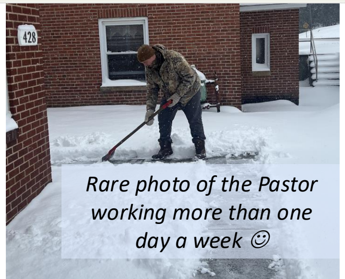
Rare photo of the Pastor working more than one day a week 😊

Departure Time: Sunday, Feb 23rd at 3 pm