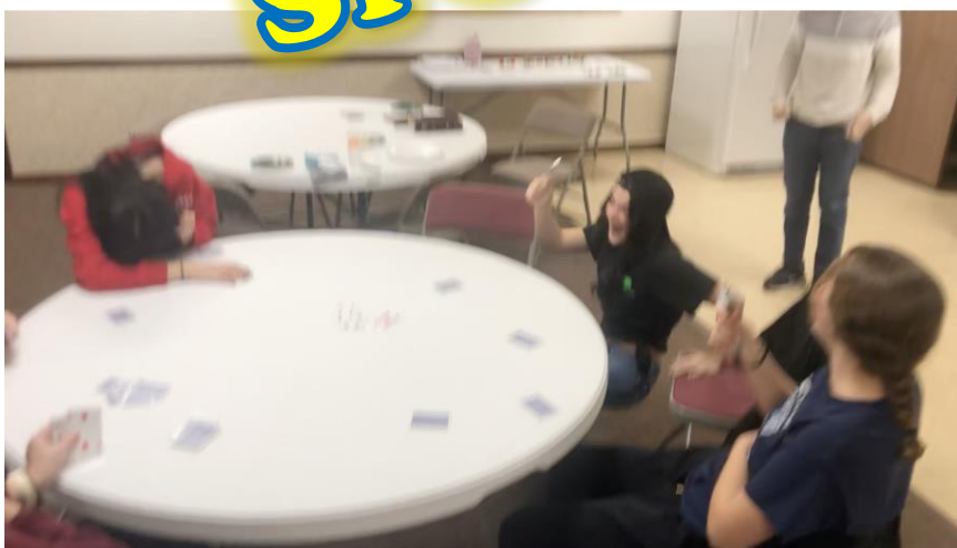
All4God Sr. High Youth playing a "friendly" game of SPOONS at Youth Group Meeting